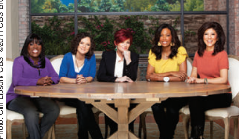
Sheryl Underwood, from left, Sara Gilbert, Sharon Osbourne, Aisha Tyler and Julie Chen, ladies of The Talk airing weekdays on the CBS Television Network.